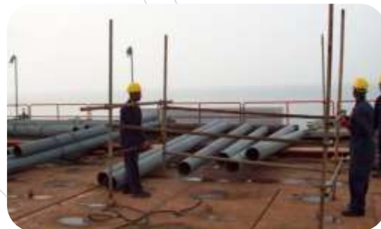
Delivery of 10" Sch. 80 & 12" Sch. 40 Pipes at Agbara Platform