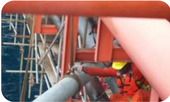
Taking Delivery of Pipes from the Deck