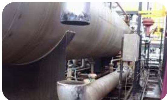
CUT OUT SECTION OF 12INCH LINE OF HP//LP SEPERATOR