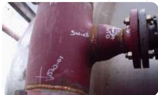
INSTALLED 12" X 6" TEE