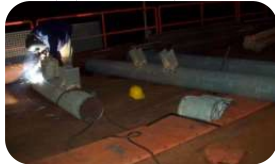
Fabrication of Saddle for Pipes