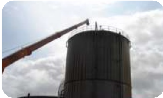
NAOC Brass terminal gun barrel