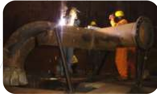
Work in progress on the gun barrel