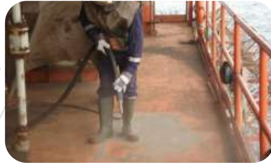
Grit Blasting of Floor Plates