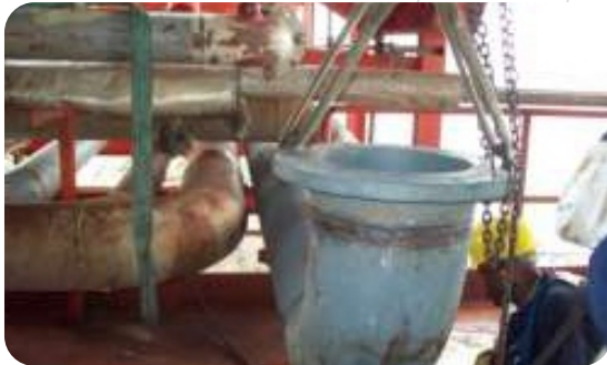
Bevelling of Joints