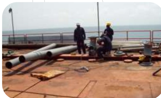
Fabrication of Pipes, Flanges and Elbows