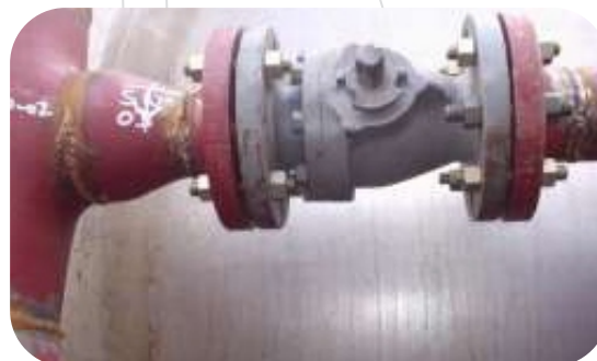
INSTALLED 12 X 6 TEE REDUCED TO 4,' BALL VALVE AND LINE