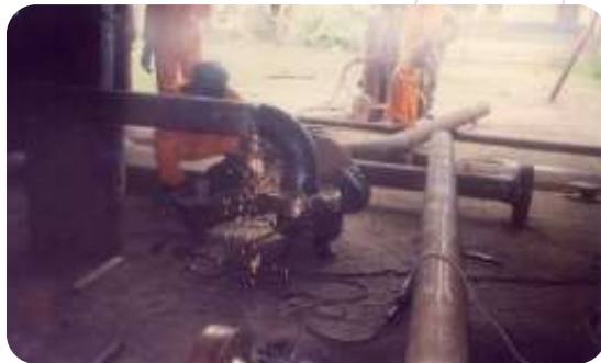
Pictures of 10" & 12" Production Line Replacement at AENR Agbara Platform