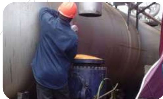
INSTALLATION OF 12 INCH BALL VALVE ON 12 INCH LINE