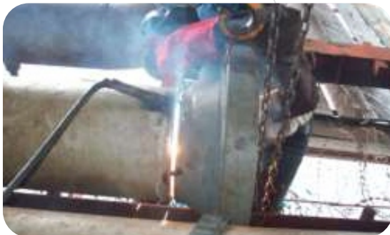
Welding in Progress (Tie in Joints)