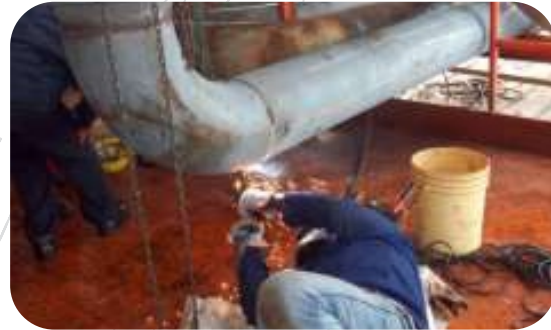
Welding in Progress